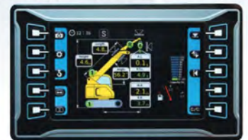
7 inch Multi Monitor